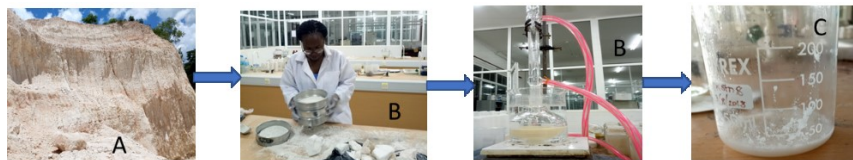
Figure 1. Step by step preparation of aluminium sulphate from Pugu kaolin (A=Kaolin deposit, B=Preparation and extraction, C=Aluminium sulphate)

In the present study, Combination tanning using mimosa and Al_2(SO_4)_3 extracted from kaolin was carried out with the main goal of exploring potential utilization of kaolin resource in leather industry (Fig. 1).